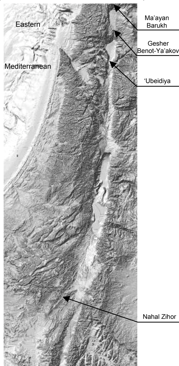
Figure 1 - Sites along the Dead Sea fault mentioned in the text on the Digital Terrain Model (DTM).

Concurrently, with the initiation of glaciations in the Northern Hemisphere ~2.6 Ma ago the earth witnessed frequent and large-scale oscillations between glacial and interglacial conditions. This climatic change continued with two further steps at ~1.7 Ma and at ~1.0 Ma. Warm and humid climate occurred over the Levant and northeast Africa during interglacial periods coinciding with maximal insolation at 65°N in the northern