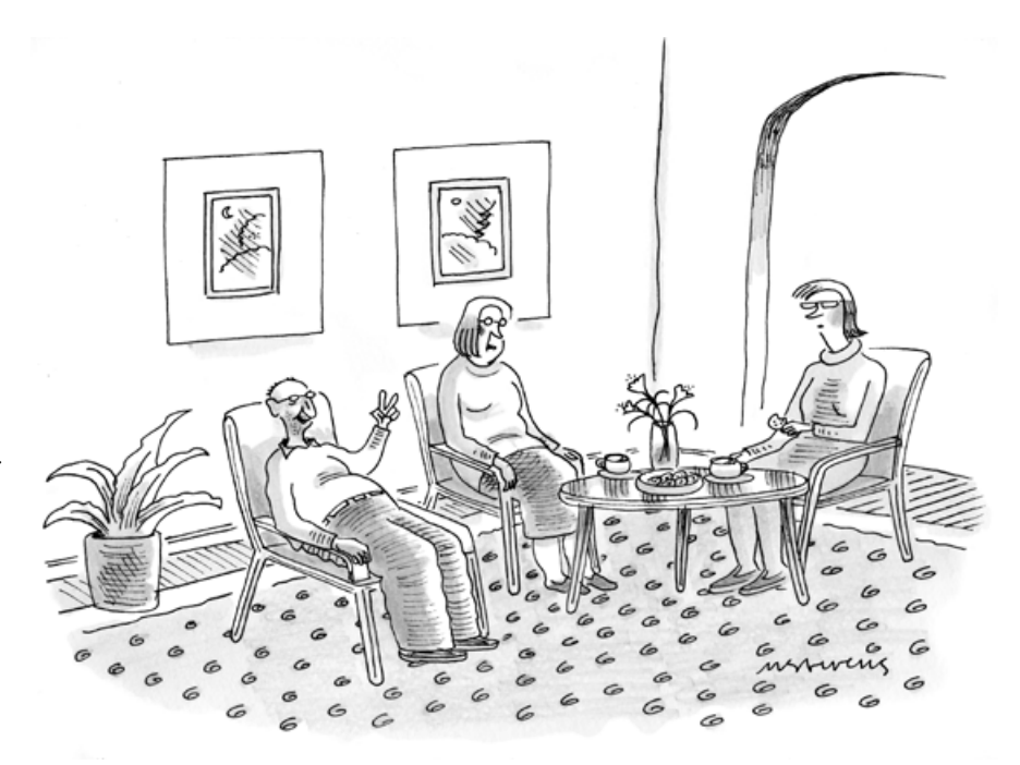
"They've got Hank on some of that medical marijuana."